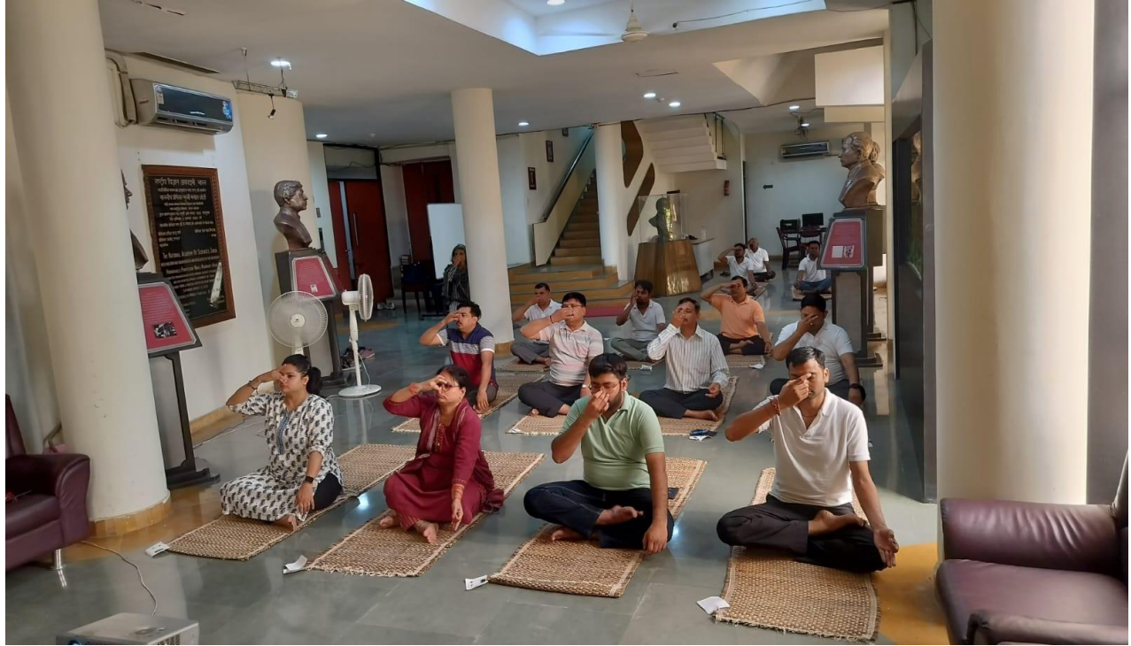
Annexure- 3 B